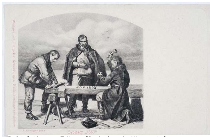
Polish Sybiracy, or Exiles to Siberia, from the Nineteenth Century source.