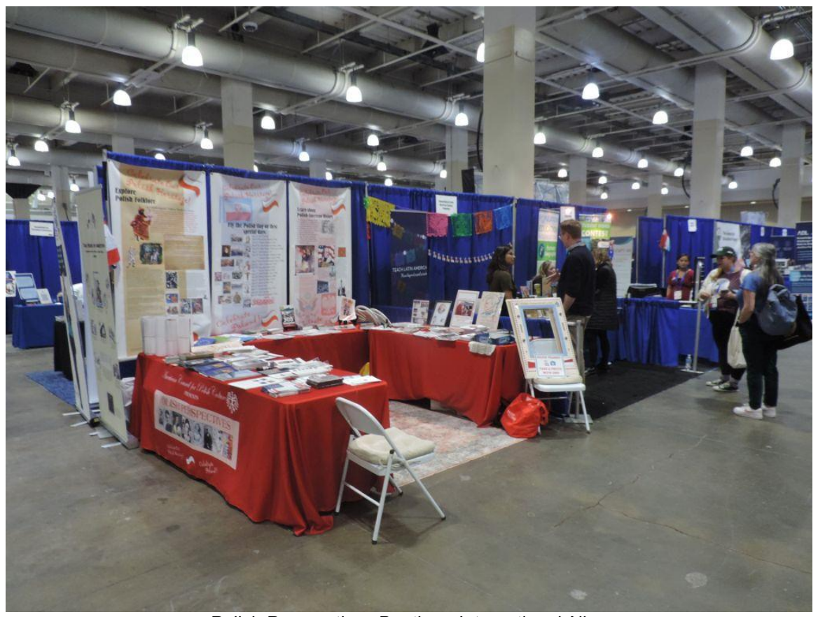
Polish Perspectives Booth on International Alley