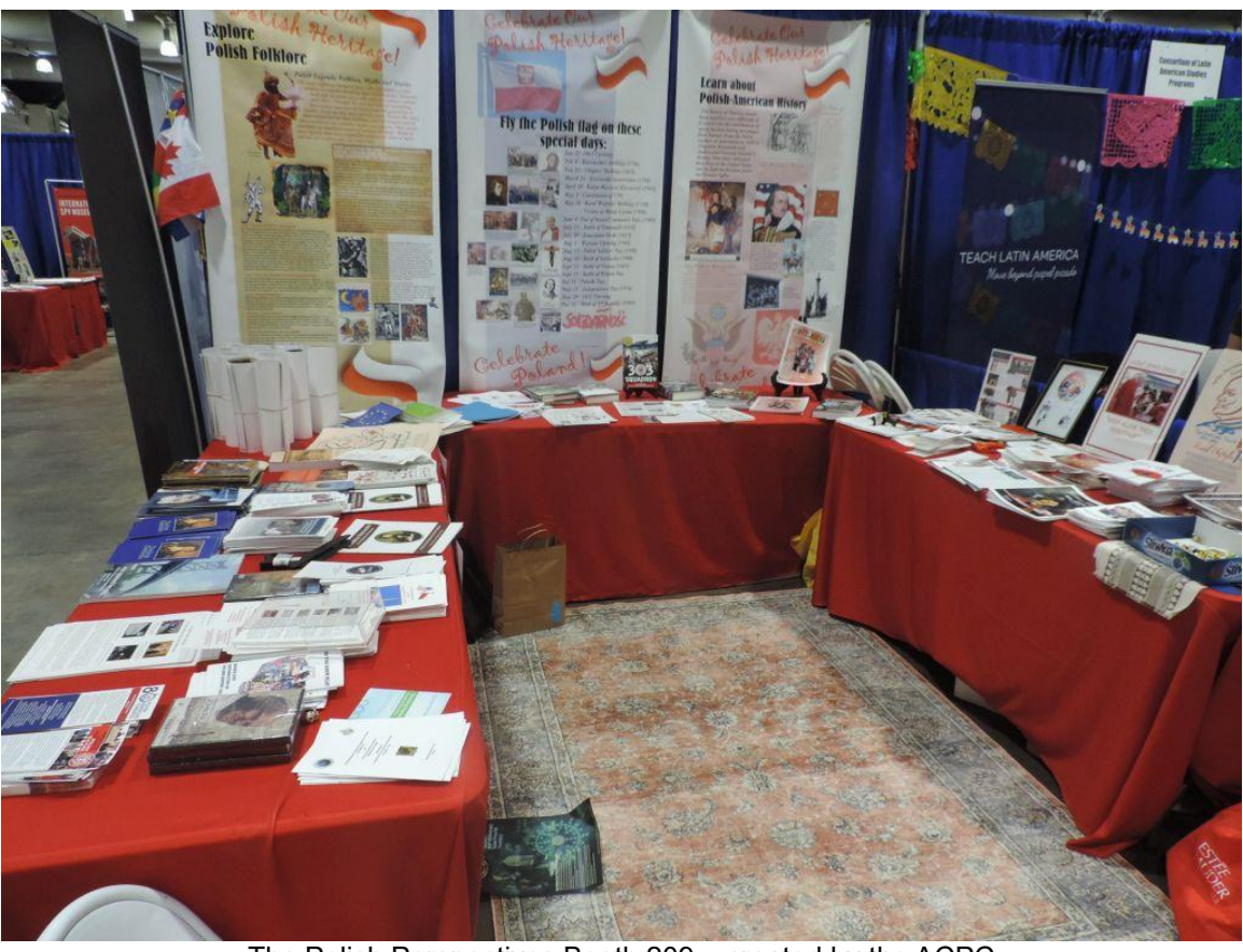
The Polish Perspectives Booth 209 - created by the ACPC